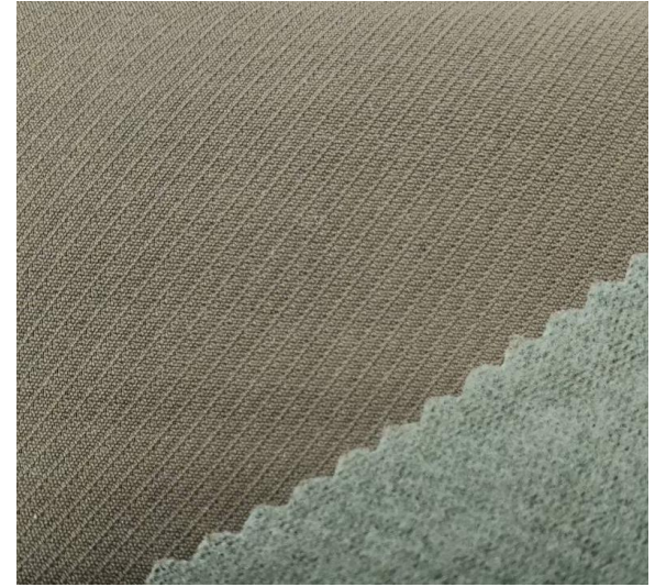
• FWDQ0050-4E7 CPN189-010A